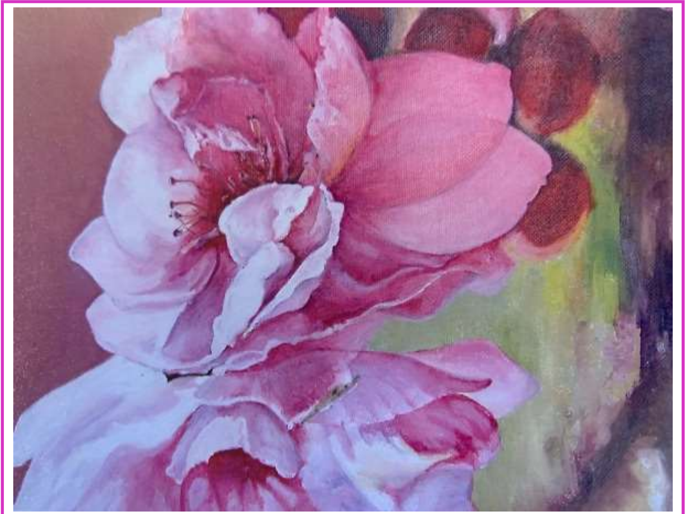
“Spring Blossoms” by Noela Woods