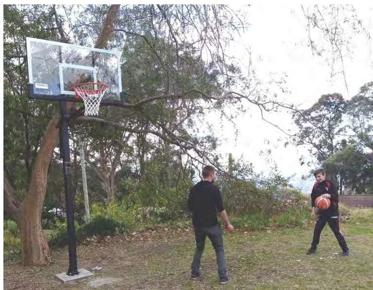
Basketball Hoop in the Park