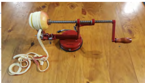
Benzer apple peeler, corer and spiral slicer