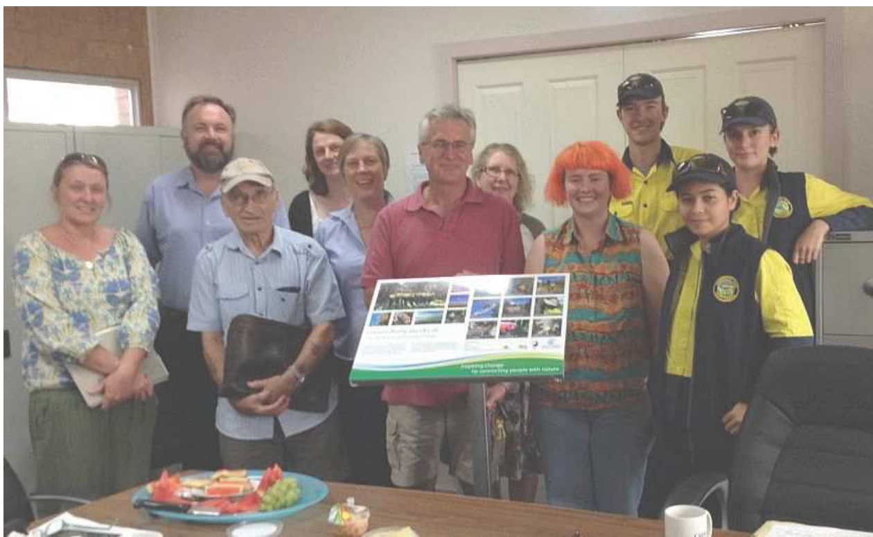
Meeting of wetland landcare group