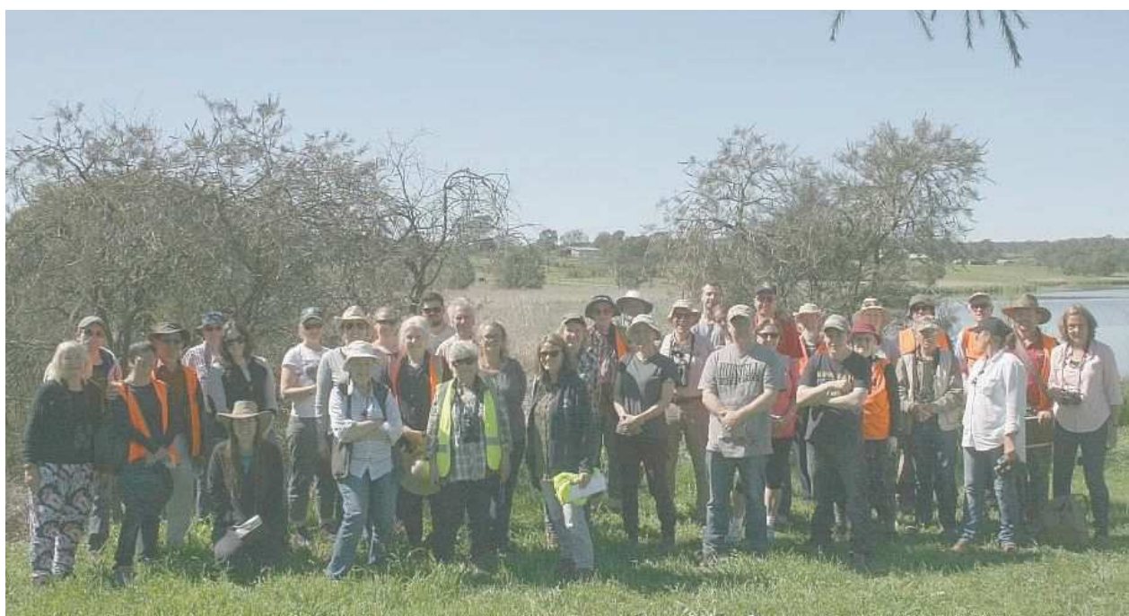
Wetland symposium tour group