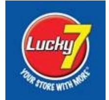
Our first customer