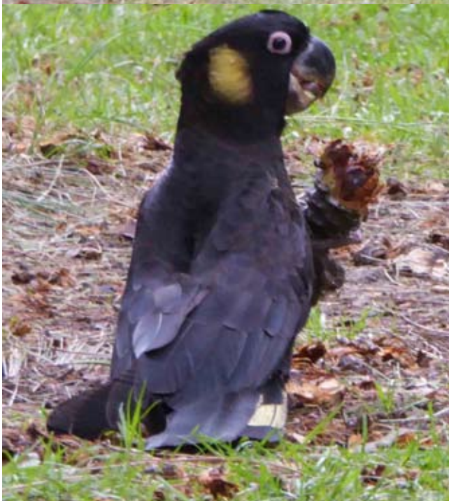
A yellow tailed Cockatoo and a Magpie with a broken wing observed in the park.